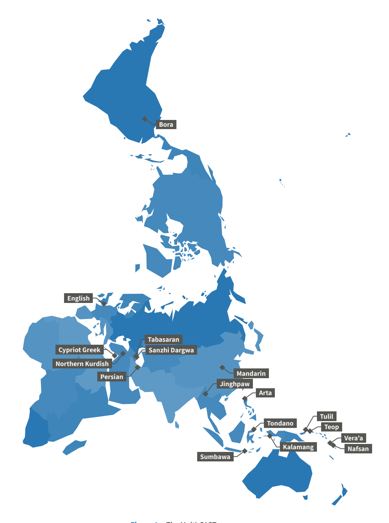
Figure 1 The Multi-CAST corpora.